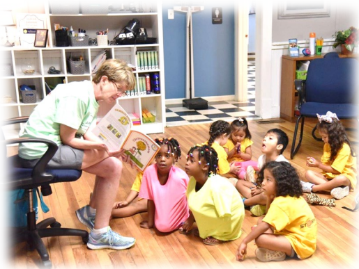
Reading Is Fun