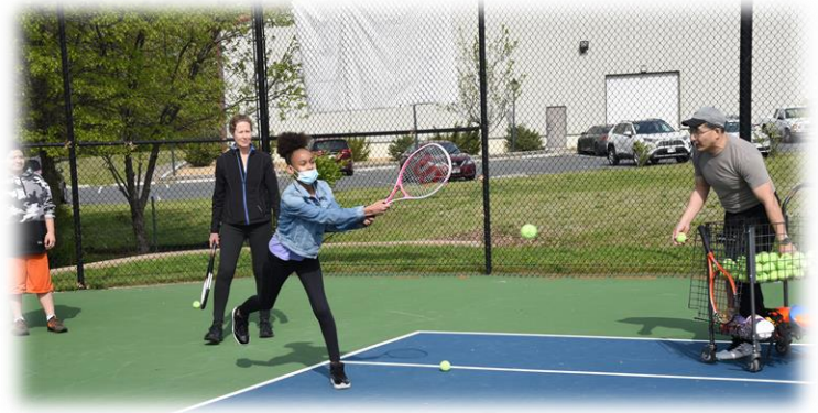
Practicing That Swing