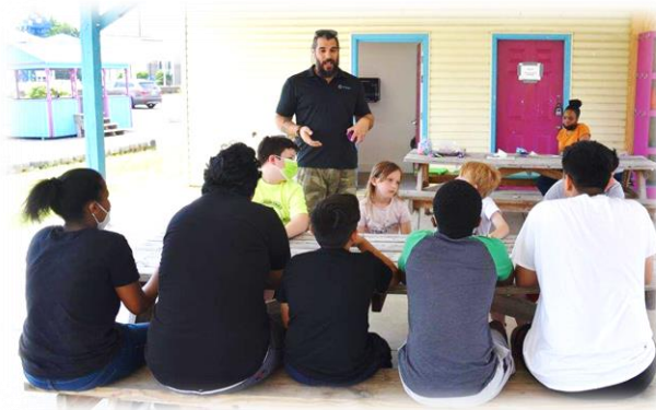
STEAM Is Fun