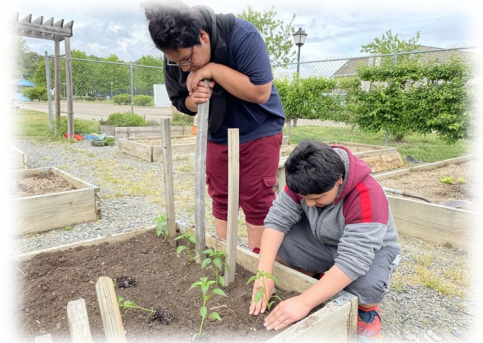
Ready for Plants