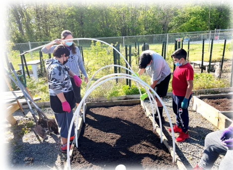
Preparing For Planting