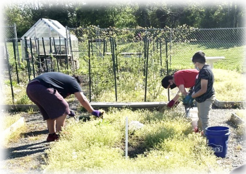
Weeding Is Hard Work